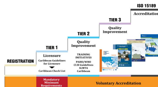
FIGURE 1: Caribbean Stepwise Approach towards Accreditation (PAHO/WHO/CDC/CROSO)